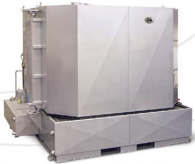
Access to the turntable allows for ease of loading from overhead

Visit www.jriindustries.com or contact JRI Industries at 417.866.8855 for a complete range of Heavy Duty Parts Washers and Options.