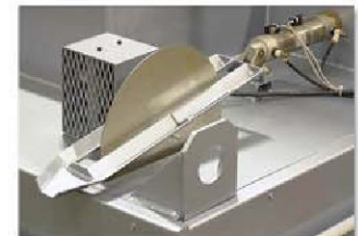
Stainless Steel Oil Skimmer